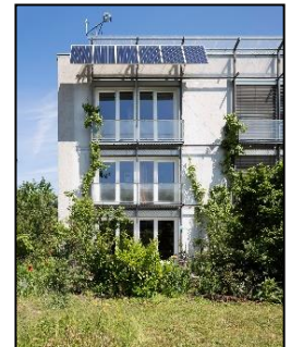
The world's first Passive House building in Darmstadt.