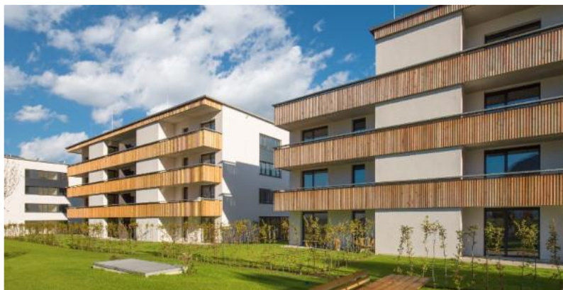
Energy efficient and cost-effective: social housing built by the housing group Neue Heimat Tirol in Kufstein, Austria.