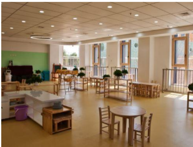
In China, many big projects are being built to the Passive House standard: kindergarten X88 in Peking with more than 21 rooms for more than 600 children.

Made-to-order solutions for energy efficient construction are also possible, as Marcel Studer and Monte Paulsen from Canada pointed out. For the First Nations residents in the remote territory of the Heiltsuk, they designed a residential Passive House building for the local clinic staff. To optimise the building standard for residential buildings in general, they now provide energy efficiency training to the residents, also in the area of airtightness.