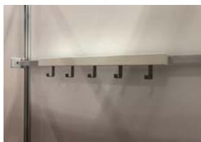
Coat Hook Line (5 hooks) available only with OC walls