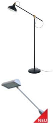
Standard Lamp black Cable 185 cm, LED lamp 11 W