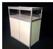
OC-Showcase Size (W*D*H) ca. 95*50*115 cm I white carcass I Acrylic glass hood H30cm I with aluminum profiles (without lighting) I Carcass and hood with 2 sliding doors on the front I doors lockable