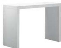
High Table Bridge 120/140 Size (W*D*H) 120/140*60*110cm I white