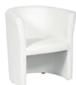
Clubchair Lounge clubchair white, surface leatherette