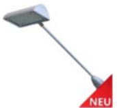
Long Arm Display Lamps LED for mounting to OC walls