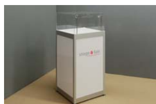
Showcase Column Size (W*D*H): ca. 50*50*130 cm I white Carcass, H. approx. 100 cm I Acrylic glass hood, H. approx. 30 cm closed on four sides I Supports (edges) and frames made of aluminum I integrated LED spots I not lockable