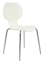
Chair II I white Seat and backrest shaped, white, chairbase chrome