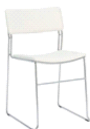
Chair I I white Seat and backrest leatherette white, chairbase chrome