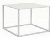
Coffee Table II Size (W*D*H) 59*59*42cm I white or black tabletop wooden I base/ frame painted metal