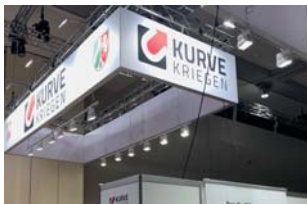
ERCO System Lamps for individual booth lighting