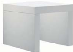
Side Table Bridge 45 Size (W*D*H) 45*45*45cm I white