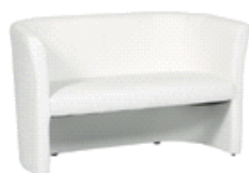
Clubsofa Lounge clubchair white for two, surface leatherette