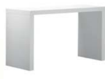
Conference Table Bridge 120/140 Size (W*D*H) 120/140*60*75cm I white