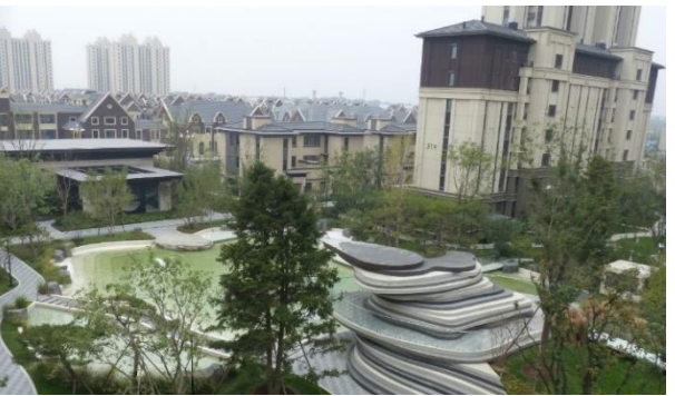
The Passive House Institute and the international network iPHA were also represented at the Specialist Exhibition in Gaobeidian (left). Excursion to the Passive House settlement Bahnstadt Gaobeidian (right).