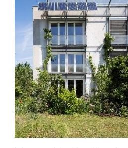
The world's first Passive House building in Darmstadt-Kranichstein.

The Passive House Standard can be combined well with on-site renewable energy generation. Since April 2015, the new building classes "Passive House Plus" and "Passive House Premium" have been available for this supply concept.