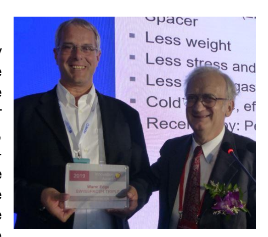
Four companies received the Innovation Award 2019 in Gaobeidian.

Gaobeidian, many manufacturers of Passive House components were awarded a certificate for their products. In addition, the winners of the Component Award and Award Innovation were presented by the Passive Institute. The Innovation Award went to the following companies: