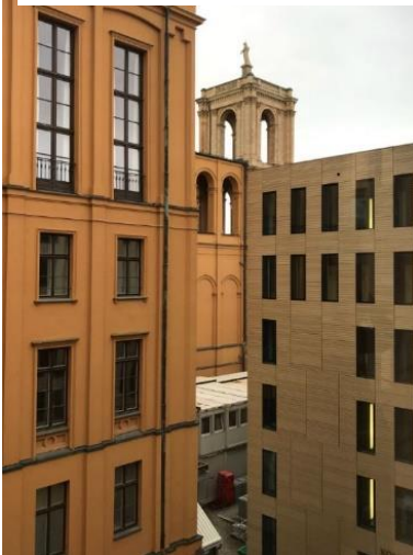
The historical Maximilianeum built in 1874 on the left, with the energy efficient Passive House annex on the right.