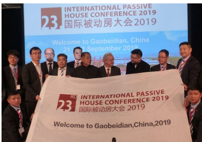
The Passive House Institute creates a stir: the 23 rd International Passive House Conference in 2019 will take place in China.

The decision to hold the next International Passive House Conference in China, and thus outside of Europe for the first time, was received with respectful applause by the audience in the MOC event centre. "Each new building in China brings with it an additional demand for energy for heating and cooling, therefore it is very gratifying that serious efforts are being made in China to radically improve the energy efficiency of buildings. There is still a chance of meeting the climate protection objectives," explained Professor Feist. The Passive House Conference in China will take place on 21 and 22 September 2019.