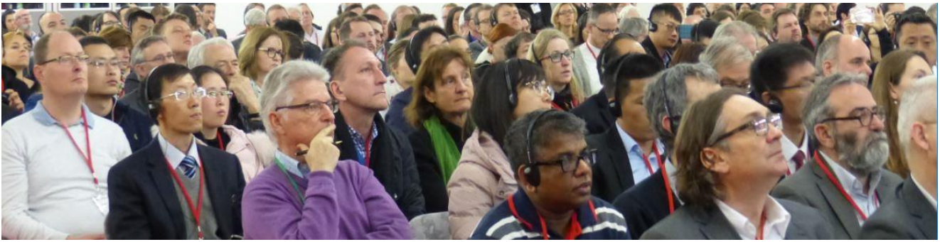
The plenary hall was jam-packed once again with over 1000 participants from more than 50 nations. The focus of this year's Passive House Conference was on the compatibility of energy efficiency and economic feasibility.