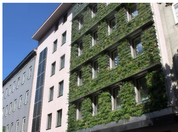
Living to the Passive House Standard: Left, a PopUp dorm for students in Seestadt Aspern, which can be dismantled and rebuilt in a different location. Right, the Stadthotel with its green façade.