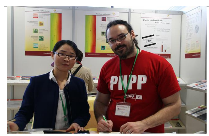
Presentation and sale of the planning tool PHPP, for the reliable projection of the energy balance of buildings.