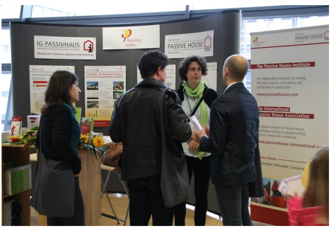
Conference visitors at the Passive House Institute's stand.