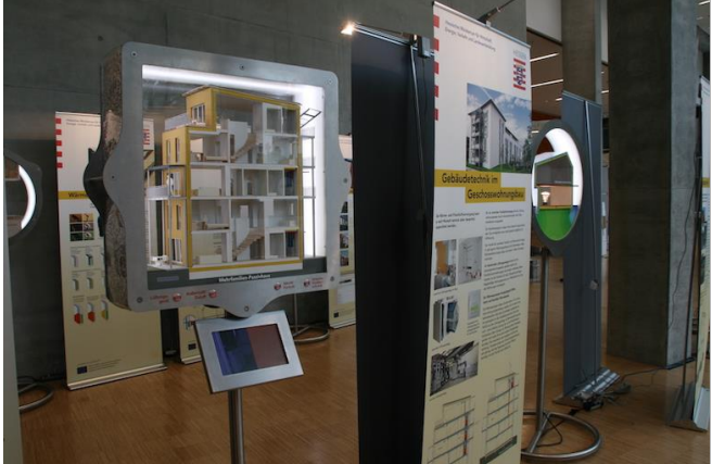
The Passive House Forum for building owners in the region. Models illustrating the Passive House principle.

Further information: www.passivehouse-conference.org