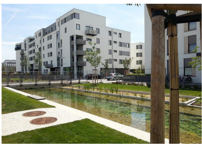
The Passive House urban settlement Bahnstadt in Heidelberg – one of the destinations of the excursions that took place after the Conference.

Over a third of the total energy consumed in industrialised countries is used for building operation, mainly for heating and cooling. About 85 percent of this energy on average can be saved with the Passive House Standard. Additional investment for a Passive House construction are usually amortised within a few years due to the low running costs. Of course, the heating consumption will remain low even after this time. This principle is therefore extremely attractive for building owners in economic terms.