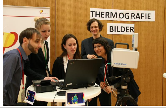
Accompanying specialists' exhibition for Passive House components.