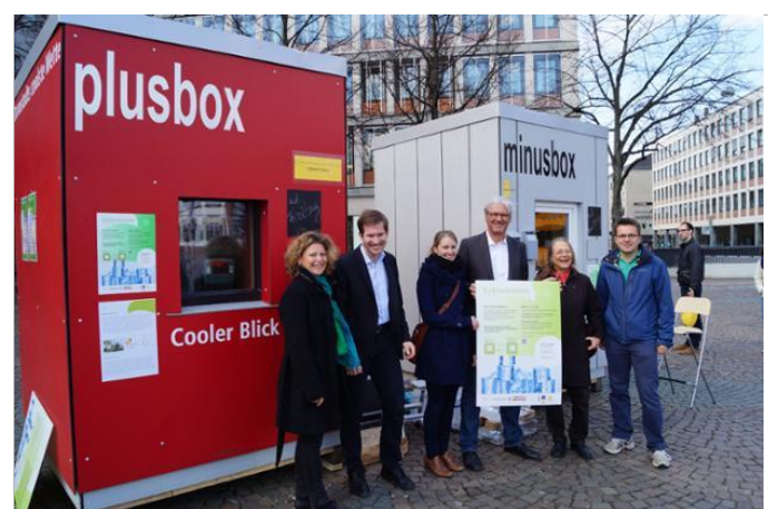
Group photo with the Mayor of Darmstadt Jochen Partsch in front of the "mini-house" for the ice block competition.